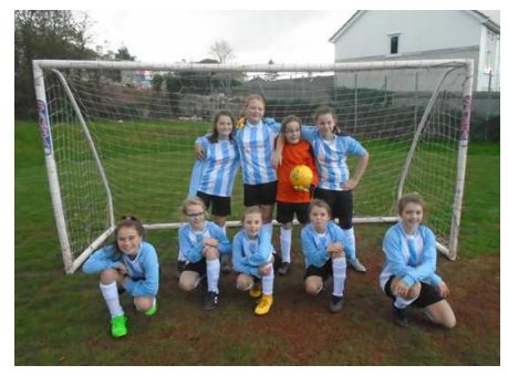
St Margaret's 2 vs St Marychurch 2