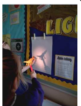
Cherry Class have been investigating how to lengthen shadows.

We had lots of activities throughout National Story Telling Week and we loved it when family members came in to share a book with us.