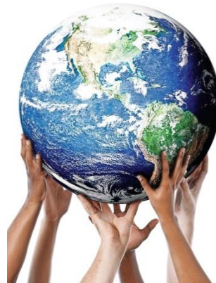
Being Me in My World Maslow's Triangle - PowerPoint Slide 1 - Ages 10-11 - Piece 3